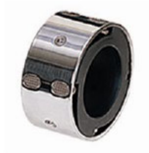
NEG 001- 40MM

Rotating material of sleeve bore core and frictional material for two sides all adopt Bakelite. The frictional strength is subject to either spring pressure or cylinder power to decide each torque assembly of slippage, for easy to control the tension adjustment in each material.